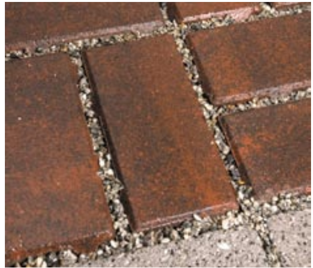
Stormwater Brick® 4" x 8" Cumberland Blend (shown wet)