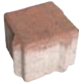
4" x 4" x 3 1/8" 100 mm x 100 mm x 80 mm