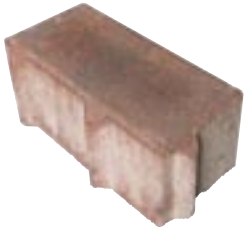
4" x 8" x 3 1/8" 100 mm x 200 mm x 80 mm