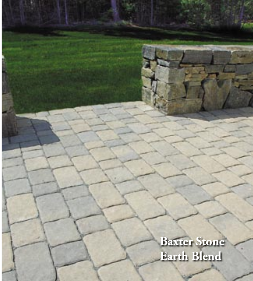
Baxter Stone Earth Blend