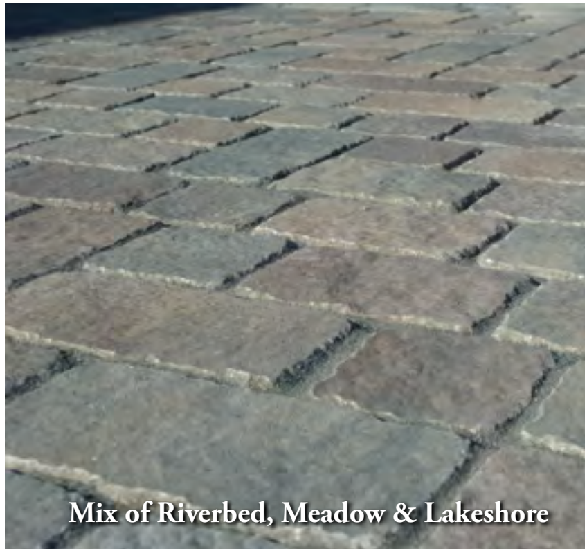
Mix of Riverbed, Meadow & Lakeshore