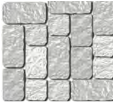
Large stone can be turned to create an Ashlar effect.